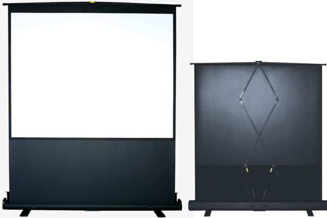
PTP Series Portable Screen