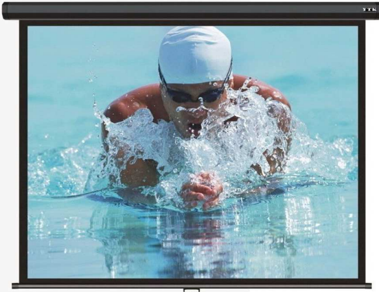
MN Series Manual Screen