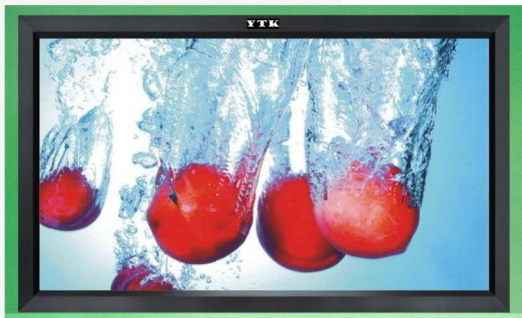
FS Series Fixed Screen